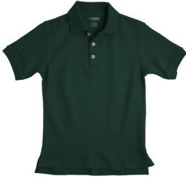
FRENCH TOAST POLO SHORT SLEEVE

All orders must be submitted to RFH Co, Inc. 79 Rockland Rd, Nwtk, CT tel. 203-853-2863 ALL SALES FINAL—NO RETURNS OR EXCHANGES