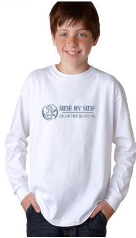
GILDAN TEE SHIRT SHORT OR LONG SLEEVE